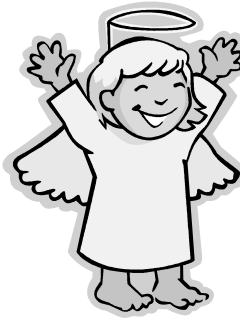
Be an angel for a child in need

This is a wonderful cause and provides an opportunity to teach our children how blessed they are and how important it is to give to those in need.